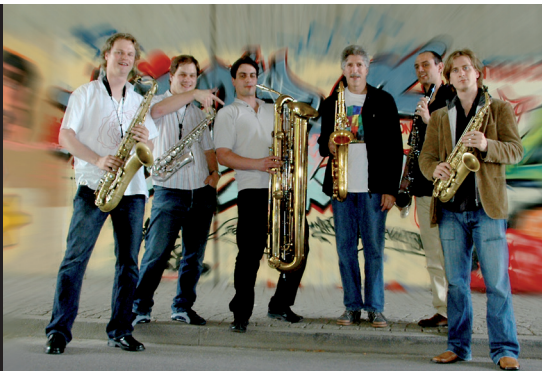
Cologne Saxophone Quintet